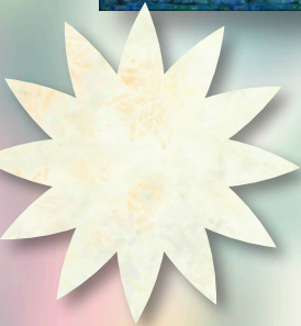
▲ C1, C2, J5, F1 TONGA-B6168-AIR 4 1/8 yd