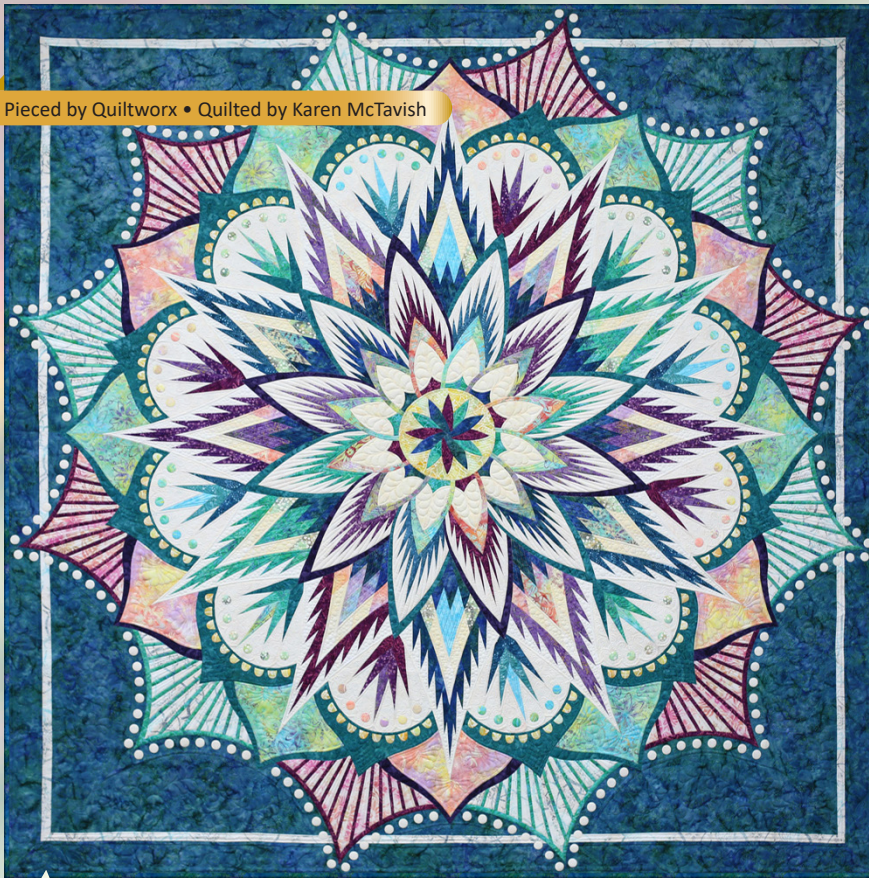
Pieced by Quiltworx • Quilted by Karen McTavish

Backing: 9 yd • Binding: 7/8 yd: TONGA-B6165 SAPPHIRE