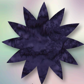
▲ C5:a, C6:a, C5:c, C6:c, C5:e, C6:e, H2:b TONGA-B7900 JAZZ 1 1/8 yd