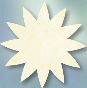
▲ D11:a to D11:f, E1 TONGA-B7900-GHOST 2 1/4 yd