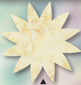
▲ B1, D7:a to D7:f, D10:a to D10:f TONGA-B8786-IVORY 7/8 yd