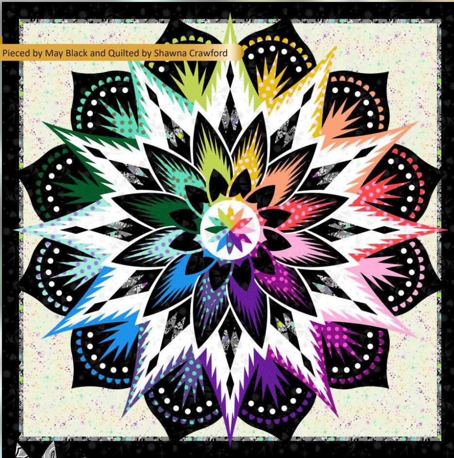
Pieced by May Black and Quilted by Shawna Crawford

Backing: 7 3/8 yd • Binding: PWTP157.INK Fairy Flakes, 3/4 yd