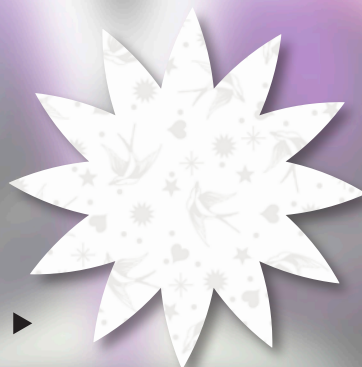
A1, C5, C6 D2, D4, D7, D8, D9, D10, E2, F3 PWTP157.PAPER Fairy Flakes 3 1/2 yd