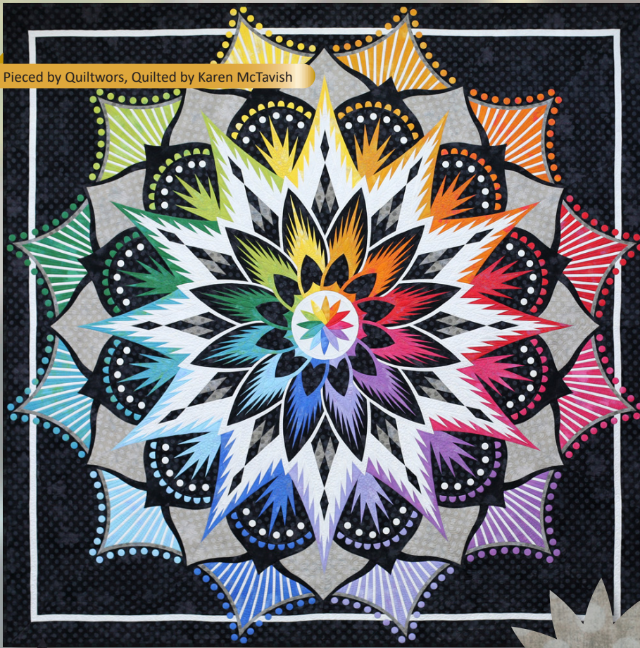
Pieced by Quiltwors, Quilted by Karen McTavish

Backing: 9 yd • Binding: 7/8 yd: 30149-34