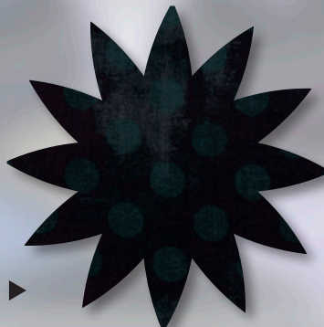
B1, D1, D6, D11, F1, J2, J4 30149-34 7 1/2 yd